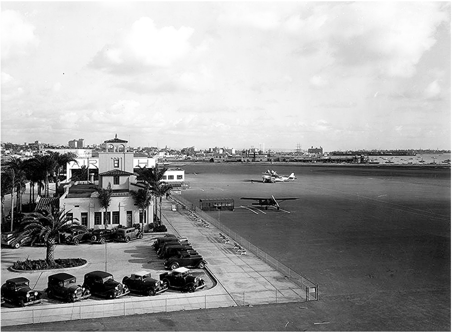
Lindbergh Field 1938 – Douglas RD-2 Dolphin U.S Coast Guard aircraft sitting on the ramp...alone.