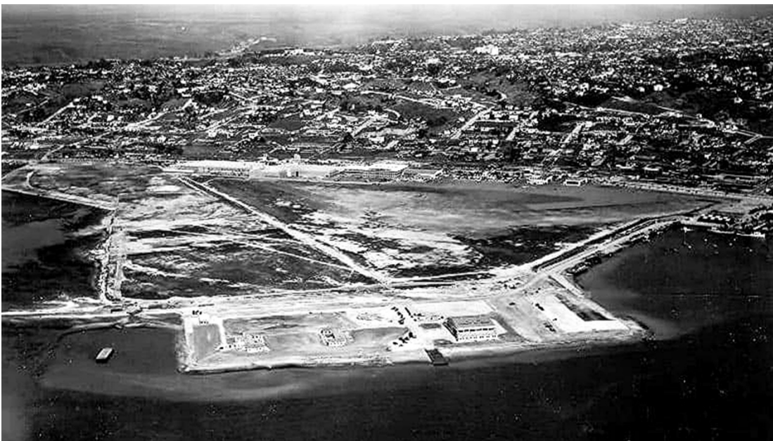
Lindbergh Field, San Diego – photo 1937 with U.S.C.G. Air Station in foreground. Ryan hangar in center. The Coast Guard noted because of my personal background. I enjoy the history.