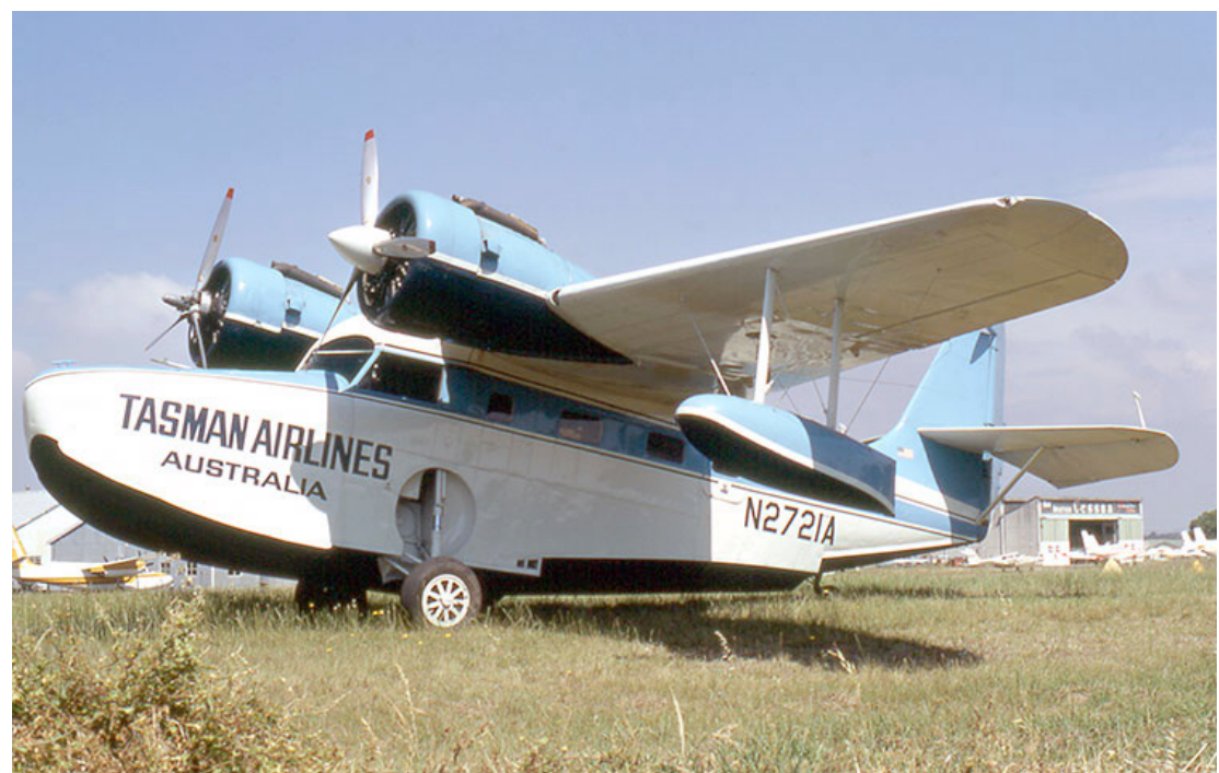
Grumman JRF-5 Goose N2721A (c/n B-54) at Sydney-Bankstown in November 1974.

First flown at Grumman's newly established plant at Bethpage NY on 29 May 1937, the Goose proved to be an outstanding aircraft in both civil and military use. All models were built with variants of the 450hp P&W R-985 Wasp Junior engines. Goose production totalled 345 aircraft, ending in October 1945 at Bethpage.