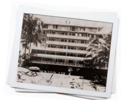
The Edgewater, built 1950