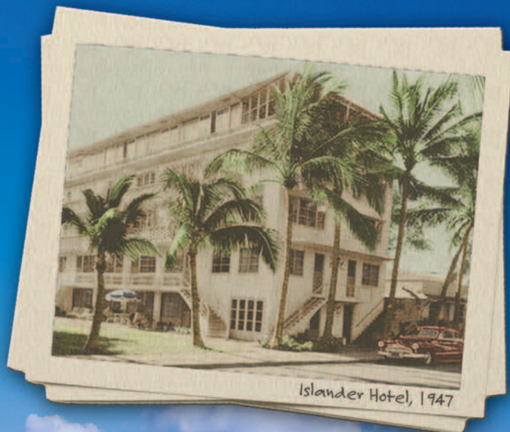
Islander Hotel, 1947