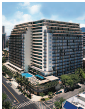
OHANA Waikiki West formerly Outrigger West