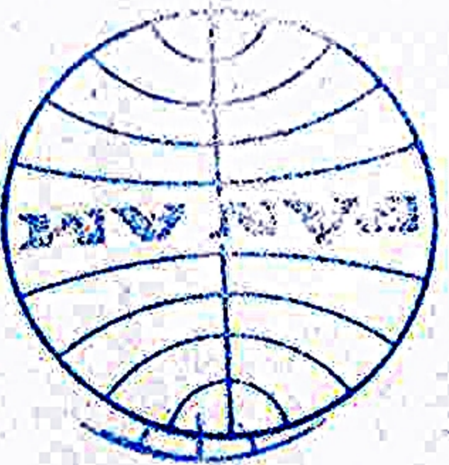
PHOTO NO. _____