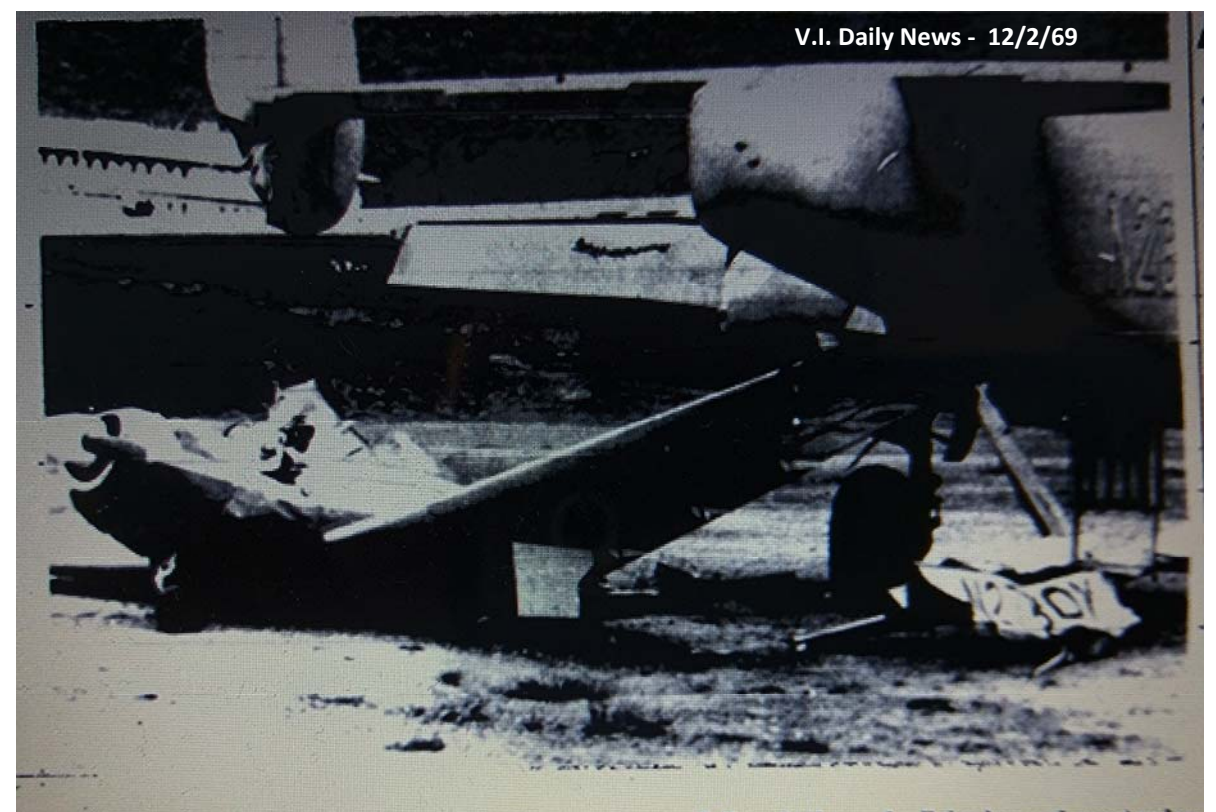
THIS SINGLE ENGINE Incomey airplane was one of the victims of a Prinair crash yesterday at the airport. The plane, which was parked, was hit by the Prinair craft as it crashed on landing yesterday. The Mooney craft was to be sold Friday according to Dick Lawrence of Zinke-Smith. He placed the value of the plane at $28,000. The tail of the larger plane, B-25, owned by Antilles Airboats, was also damaged in the mishap.

Antilles Air Boats started operating Consolidated PBY Catalina seaplanes in 1969. There were two types of PBY's—one with PW R-1830 and two with PW R-2600 (Super Cats).